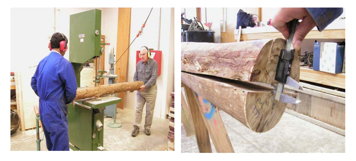
Figure 1: Log sawing and opening measurement

After growth strain and acoustic velocity measurements, logs were sawn into two half rounds along the length using a band saw. The sawing was done in the plane perpendicular to the sides of strain measurement. Immediately after sawing, the two halves were re-assembled to reconstruct the log and were clamped together using a G-clamp at the centre point. Both half-rounds bowed in the outward direction. The opening-up at both ends of the logs was measured using a digital vernier caliper. The measurement of distortion on sawing the logs was taken to be the mean of the two opening gaps between the two sawn half-rounds measured at both ends. The process of log sawing and measurement of openings are shown in Figure 1.